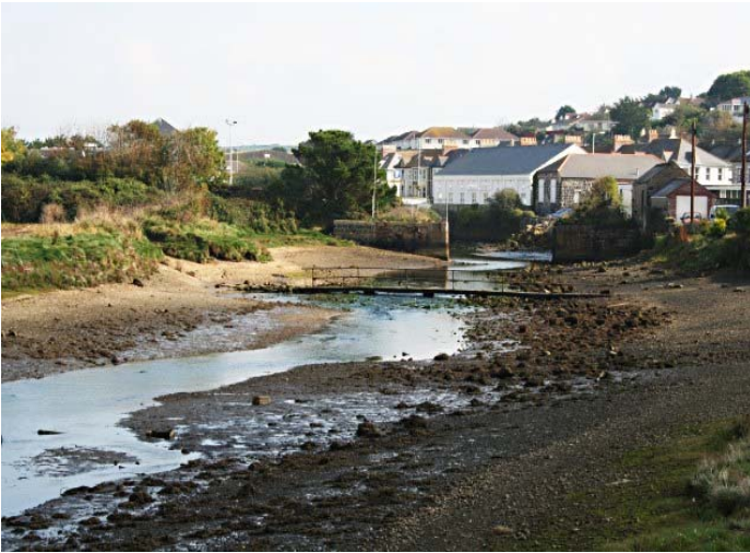
Copperhouse Pool (Angarrack Stream)*

We want to improve water quality in the Angarrack and Stennack streams in Cornwall. This briefing note sets out the pressures facing the water environment in the catchment.